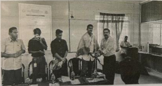
R&D Head Honoring the Fellow Guest