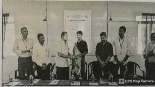
Honouring the Chief Guest by Secretary

Approved by AICTE & Affiliated to Anna University Anand Nagar, Nellikuppam Main Road, S. Kumarapuram, Cuddalore - 607 109, Tamil Nadu. ☎ (04142) 285 601 - 604 🌐 www.kcet.in ✉ info@kcet.in