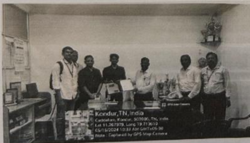
Atal Incubation Centre -MOU Signing