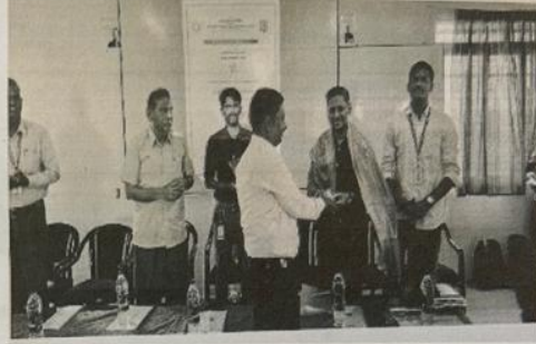
Honouring the Guests