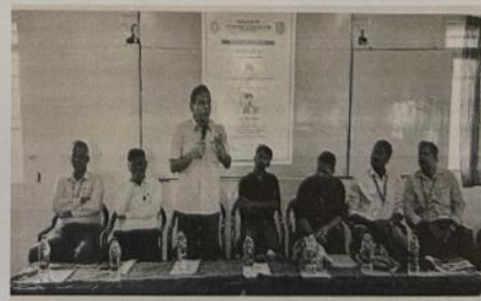
Secretary interaction on raised platform