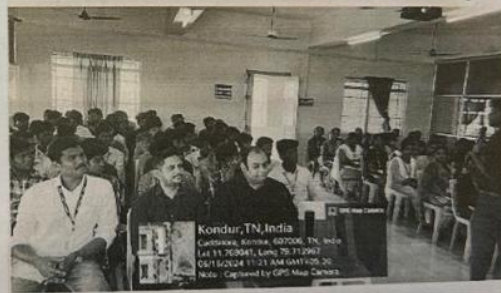
CEO, Atal Incubation Centre interaction with Participants