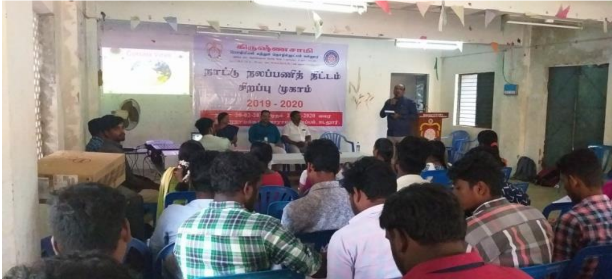
Family Welfare & Corona Virus Awareness Programme held on 21-02-2020 at Karamanikuppam Village, Cuddalore

During the COVID-19 pandemic, our institution served as a government-designated isolation ward, showcasing our infrastructure and crisis leadership. We provided essential healthcare support, demonstrating readiness to aid public health and minimize pandemic impact. Hosting vaccination camps in collaboration with local health centers aimed to ensure broad vaccination coverage and enhance community well-being.