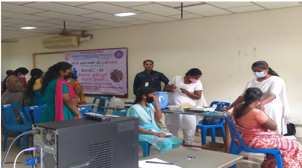
Free Covid-19 Special Vaccination at KCET, Cuddalore on 28.08.2021