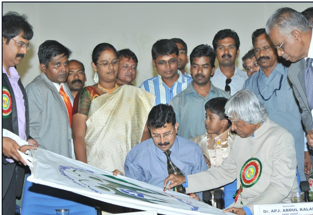
Photographs of Green Kalam Initiative Programme