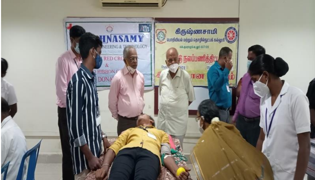
Blood Donation Camp held on 01-10-2021 at KCET, Cuddalore