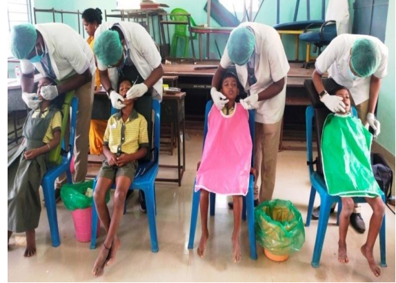
Special Dental Camp for Children on 21.02.2023