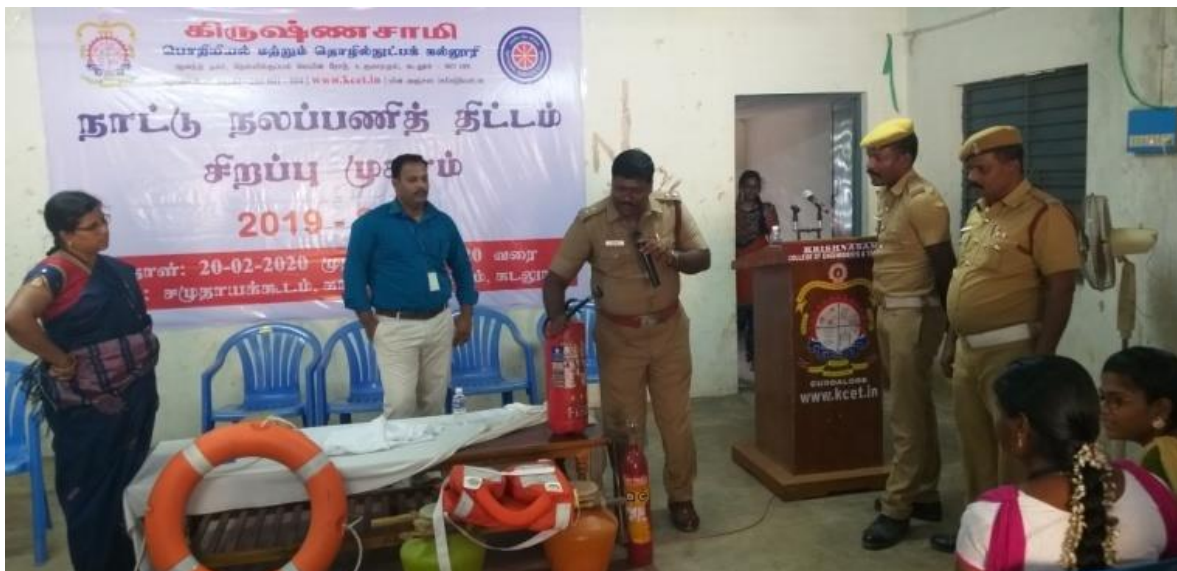
Fire safety Programme held on 21-02-2020 at Karamanikuppam Village, Cuddalore