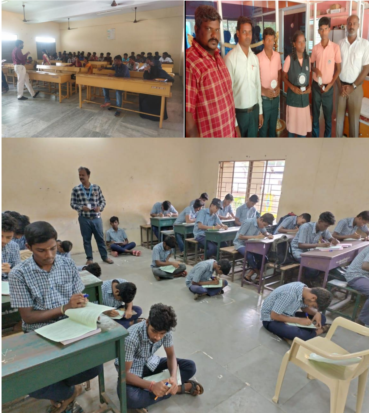
Photographs of Career guidance programme and Scholarship test conducted to school students

Our institution conducts "Career Planning and Scholarships" guidance programs in regional schools to inspire students toward careers in engineering and related fields. We also organize scholarship examinations to encourage higher education among economically disadvantaged and rural students.