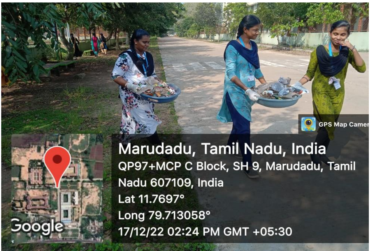
Mass Cleaning Camp conducted in nearby villages of KCET on 17.12.2022