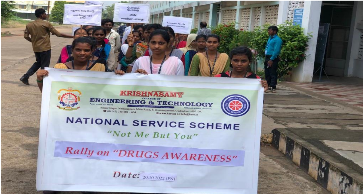
Rally on “Drugs Awareness” held on 20.10.2022 at KCET campus to Varakalpattu, Cuddalore

Our NSS unit fosters holistic student development through community service initiatives, organizing special camps in nearby villages. These activities include workshops, health camps, and awareness programs, earning appreciation certificates for their impact. They cultivate skills like organizational management, critical thinking, creativity, empathy, and leadership, benefiting both students and the local community.