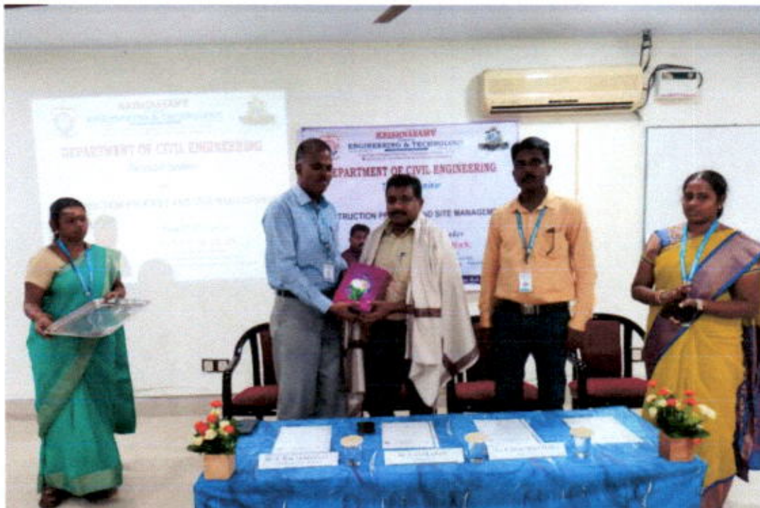
Program Initiation session with Chief Guest for Technical seminar