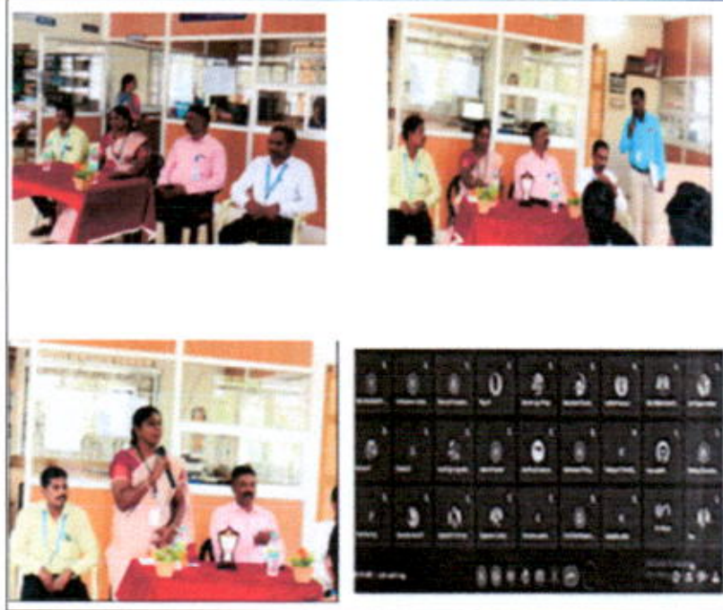
Speaker Interaction & Session Attendance