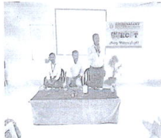
Allocation of Office Bearers