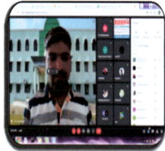
Speaker session in Google meet