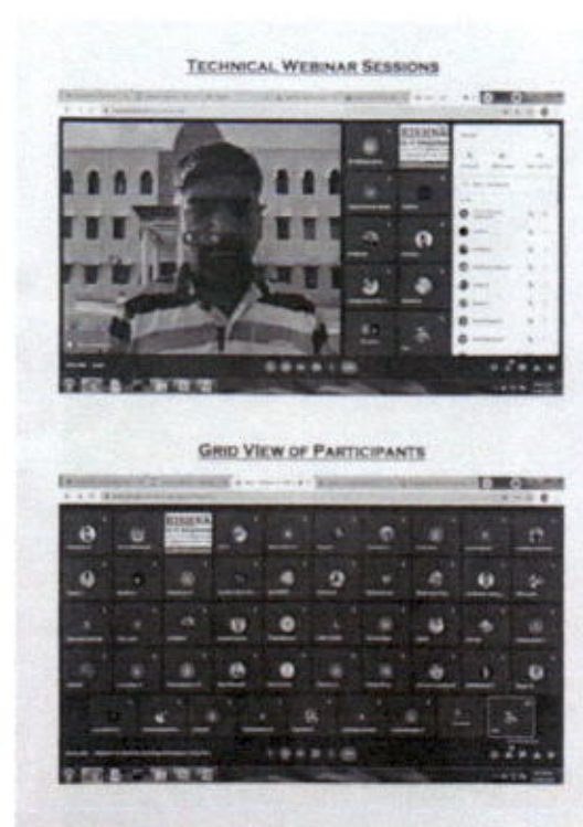
Screen shots of Webinar