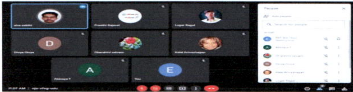
Student Session Attendance and Feedback Form held on 10.08.2018

Approved by AICTE & Affiliated to Anna University Anand Nagar, Nellikuppam Main Road, S. Kumarapuram, Cuddalore - 607 109, Tamil Nadu. ☎ (04142) 285 601 - 604 🌐 www.kcet.in ✉ info@kcet.in