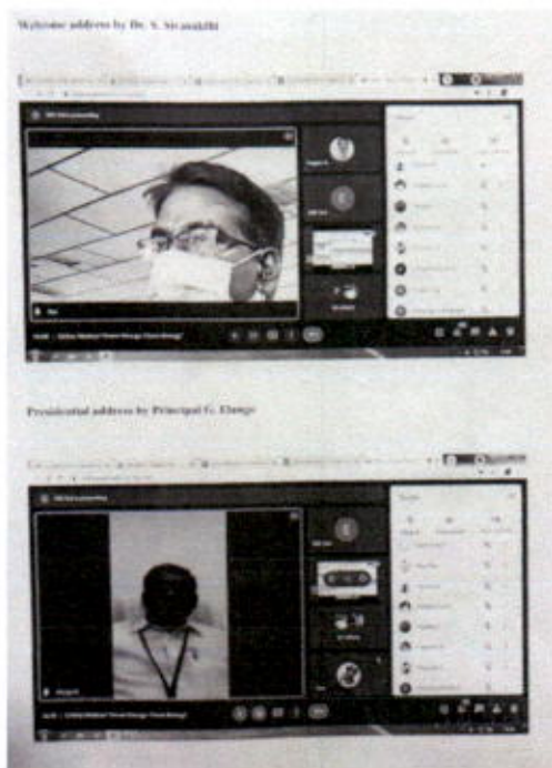
Screen shots of Webinar