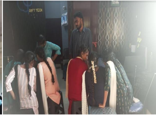
Conversation with technical expert