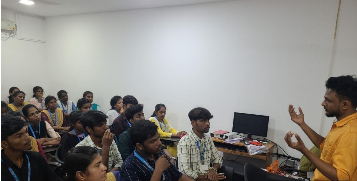
Interaction session with industrial professional

KRISHNASAMY COLLEGE OF ENGINEERING AND TECHNOLOGY Anand Nagar, S. Kumarapuram, Cuddalore - 607 109. Department of Electronics and Communication Engineering