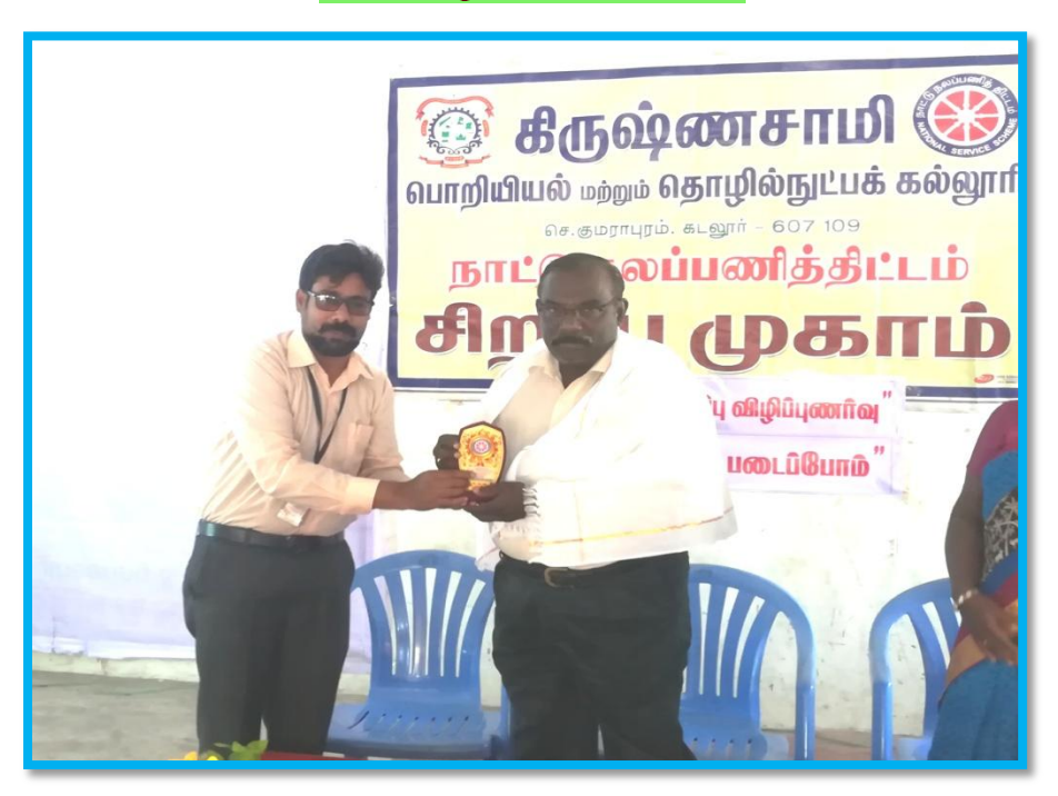
"Creating a Plastic free Nation"