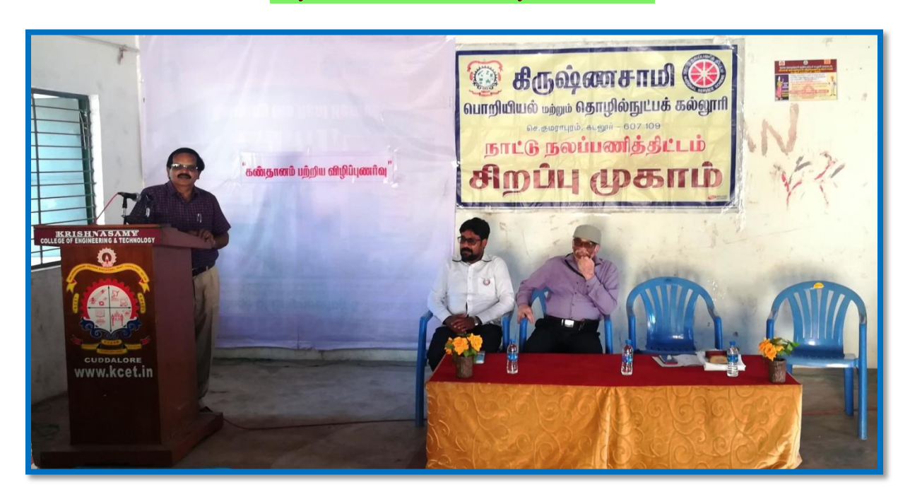
"Eye screening camp"